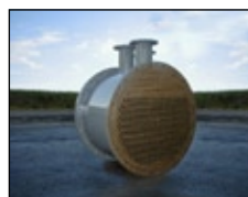
New or Overhall of Heaters