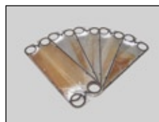
Cleaning/Overall of Plates