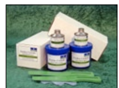
FWG Coatings Nordtec Ceramic