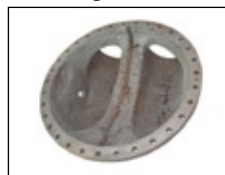
New or Repair of End Covers