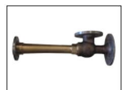
Complete or Spares for Ejectors