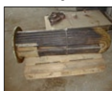
Repair/New Tube elements