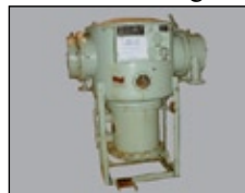
Complete overhaul of AFGU 1S15