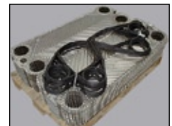
New Gaskets from Stock