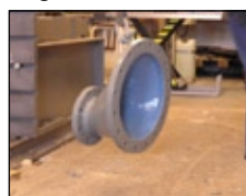
New Water Trap